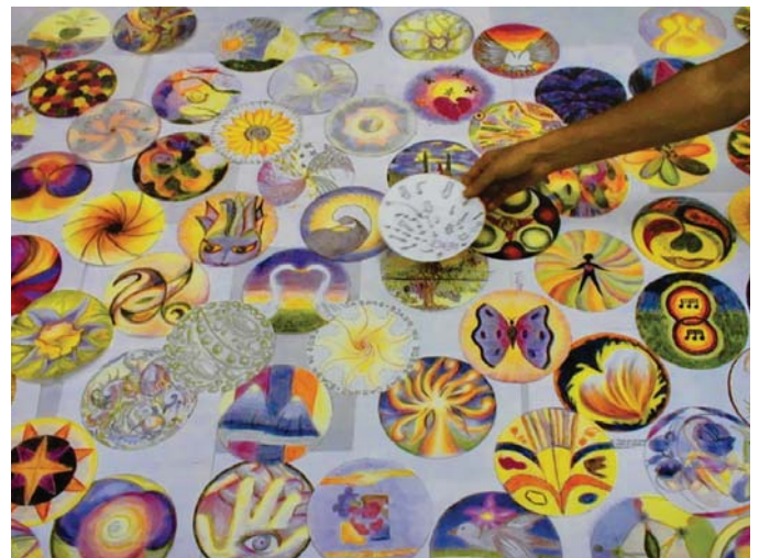
Personal peace symbols from a Mandala workshop with schoolchildren in NYC following 9/11 in 2001

To begin, each participant will create their own personal peace symbol. The theme that is generally used is peace, although others have been successfully used. Allow the participants to sit quietly, close their eyes, and put their energy behind their eyes like they were watching a movie. Allow the universe to show them a symbol for their own personal peace. This personal peace symbol usually arises without any trying, but if they are feeling stuck or need help, you can offer suggestions on a theme for them to find their personal peace symbol. Some theme ideas are: “illustrate freedom,” “create a solution to violence,” “create a new symbol for love without the valentine heart,” “what does physical or emotional healing look like,” OR “bring together two opposites like strength/gentleness; young/old; sky/earth; love/hate; alone/togetherness or light/darkness.”