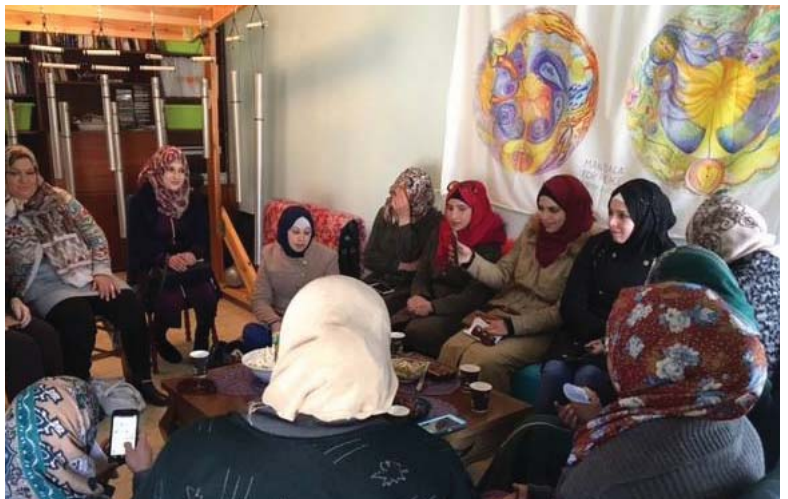
Palestinian women with fabric mandalas hanging behind them

The paper for the creation of the large group mandala can be any large piece of paper that is thin like cartridge paper or matte (non-shiny) craft paper. You can buy it in a roll from an art or craft store to get it big enough for the size you want for your group mandalas. Using the group mandala photo included in this toolkit as your guide, you can create your concentric circles with a compass which is big enough or with a string on a pencil by holding the string with your finger in the middle and circulating around and drawing each circle. You can also use bowls and large round objects of various sizes and tracing them. Use a ruler to draw the slices for the individual pizza “slices.”